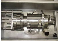
Maintaining nuclear power