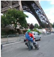
The Eiffel Tower