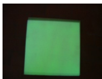
Luminous plastic paint

IBIX is an Italian firm specialising in high specification portable blasters . Advanced design ensures efficient, superior quality surface treatment finishes even in inaccessible sites. Ibiz portable blasters use a wide range of media, and can be adjusted to precise pressures for any requirement. As a result, IBIX equipment is used to clean and preserve the world's most iconic and protected historic landmarks, as well as meeting demands for precision corrosion treatment ranging from luxury car manufacturers to nuclear power plants.