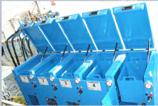
Automation in Flame Spraying for the Oil&Gas Industry