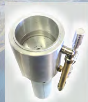
New Gun Cooling System