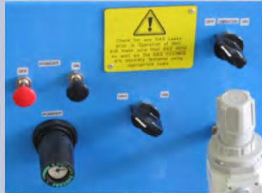
Controls on the machine