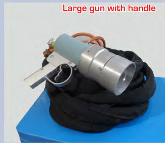
Large gun with handle