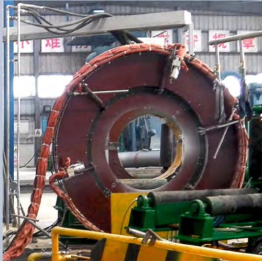
Automatic Bend Flame Spray System

* depending on the powder grade used (thickness to slump may vary)